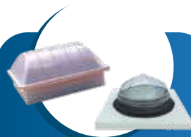
Lilly Bright | SOLAR SKY TUBE Solar Skylights