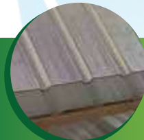
PRE INSULATED ROOFING SHEETS