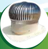
GREEN ROOF VENTILATORS