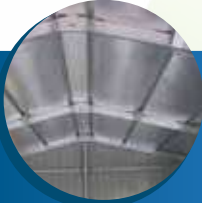
THERMNAL INSULATION SHEETS